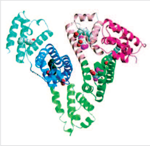
Figure 1. Three-dimensional structure of the albumin molecule. (Adapted from Cistola DP: Fat sites found! Nat Struct Biol 5[9]:751–753, 1998.)

residues are charged, resulting in a high net negative charge at physiologic pH. 3 This negative charge is important for the protein's role in maintaining oncotic pressure, which will be discussed later. The tertiary structure of albumin is quite variable: It flexes, contracts, and expands with changes in its environment 4 (Figure 1). As is typical of extracellular proteins, the folded protein structure of albumin has a large amount of disulfide binding, adding